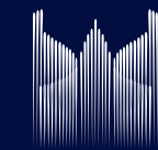
THE DUBAI FOUNTAIN

The spectacular neighbourhood of Arts and Culture